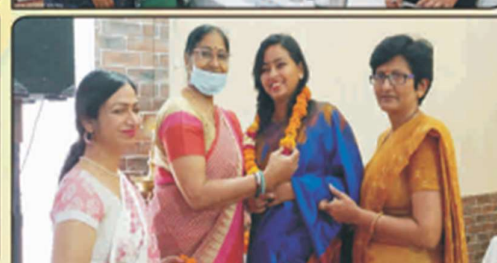
National Workshop on Sensitization Program on Recent Techniques of Water Conservation with reference to River Revival