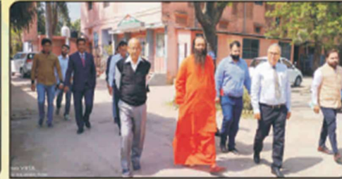
National Workshop on Sensitization Program on Recent Techniques of Water Conservation with reference to River Revival