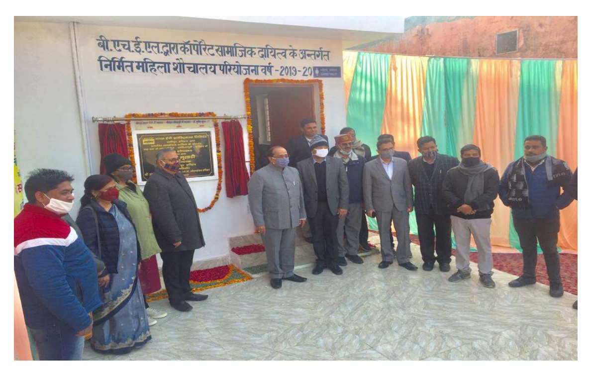
Photo 2: Inauguration of Girls Toilet in the College Campus in December 2020